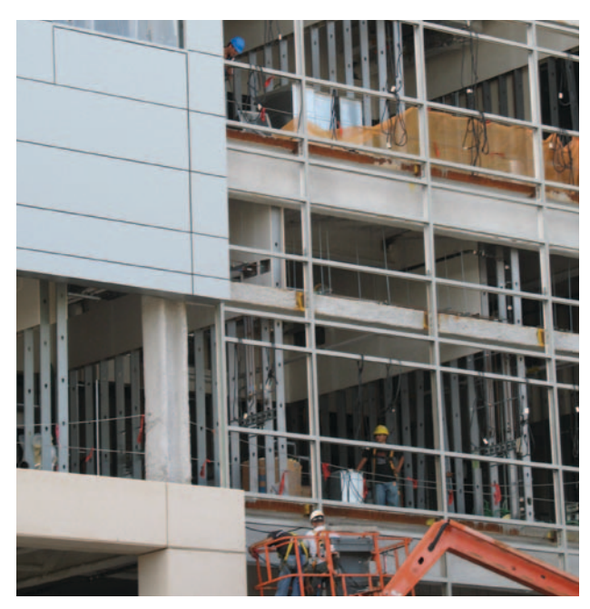
Continued on reverse