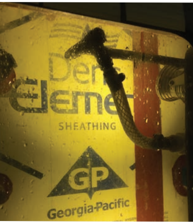
The DensElement™ Barrier System tested per ASTM E331

was cut with a bevel back towards the wall so some water was forced behind the insulation.