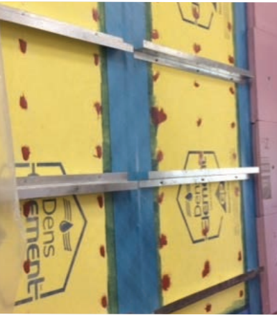
The DensElement™ Barrier System with Z-Girts installed with flanges up and down. The Z-Girts are installed both tight and spaced from the WRB. Far right test wall shows XPS attached.

Three water-resistive barrier systems (WRBs) with cladding fastener penetrations were tested: The DensElement™ Barrier System, a thin-mil fluid-applied WRB, and a thick-mil fluid-applied WRB. The DensElement™ Barrier System and fluid-applied WRBs were tested with two different cladding attachment clips - one FRP and one thermally-broken metal, and two different Z Girt arrangements (applied both flange up and flange down). Five 4'x8' test wall panels were constructed for the purpose of this testing. A sixth test wall panel was constructed to demonstrate water penetration when an XPS exterior insulation board is attached using only long screws.