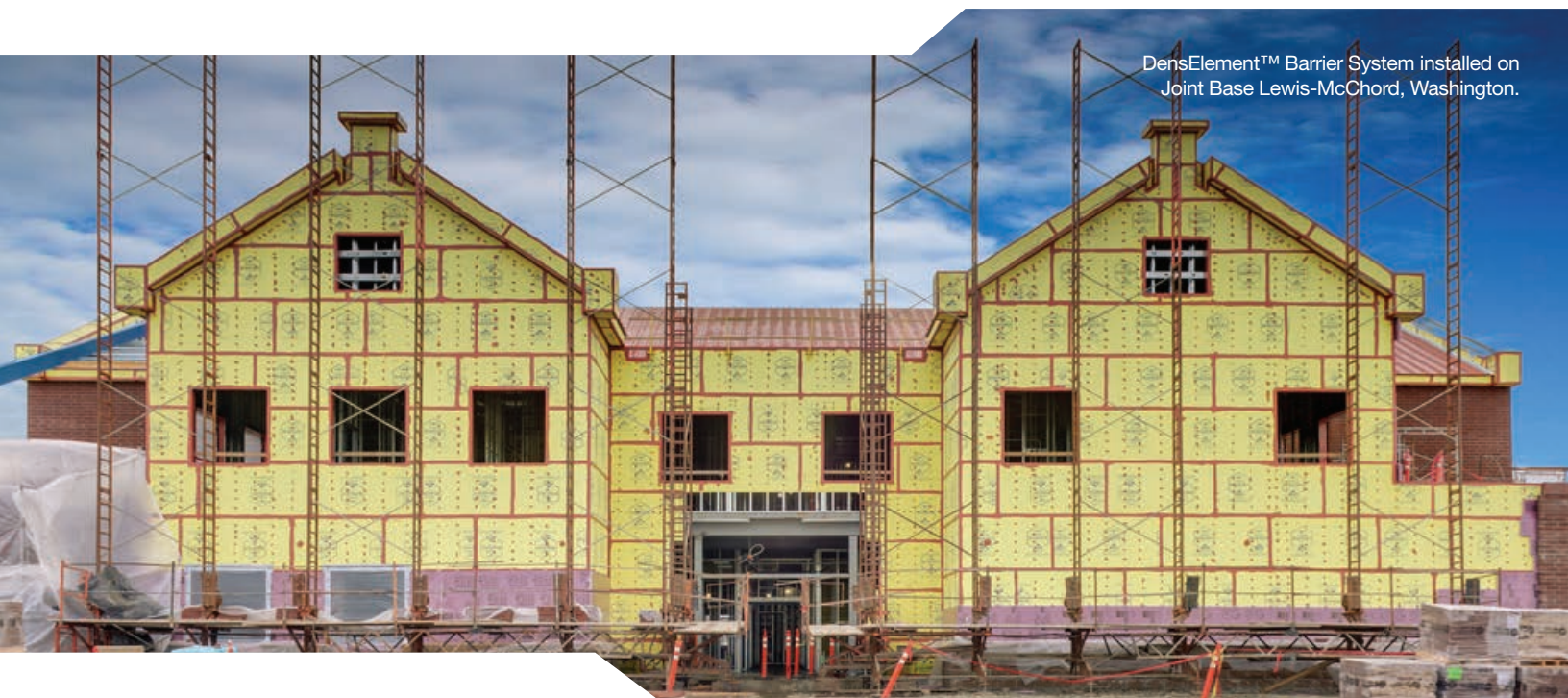
DensElement™ Barrier System installed on Joint Base Lewis-McChord, Washington.

For the exterior-insulated test wall, two inches of XPS rigid insulation was attached to the DensElement™ Barrier System panel using 4 inch long self-drilling, self-tapping screws and with large (1 in. dia.) plastic cap washers. The top edge of each piece of XPS